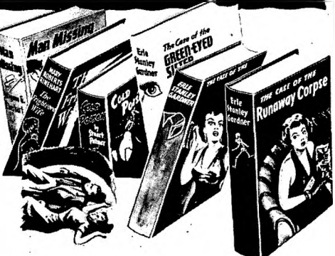
You Enjoy These Five Advantages

fully describe all coming selections and you may reject any volume in advance. You need NOT take any specific number of books – only the ones you want. NO money in advance: NO mem-bership fees. You may cancel membership any time you please.